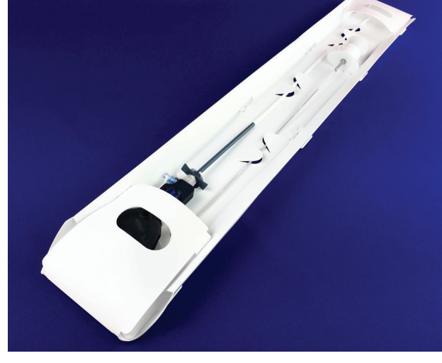
Device used in pediatric heart surgery

Unmatched design expertise, robust card configurations and the ability to get immediate feedback = higher confidence in passing testing the first time.